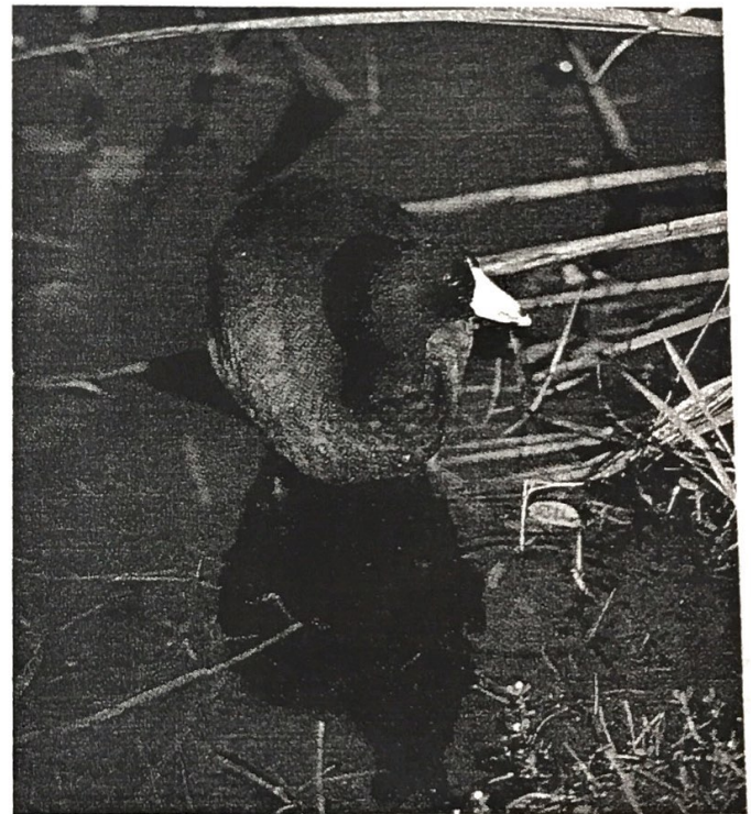
An American coot.

"Hah-ho!" the little coot said. "Thank you, Maheo," and he put his head under the water and swam down and down and down and down, until he was out of sight.