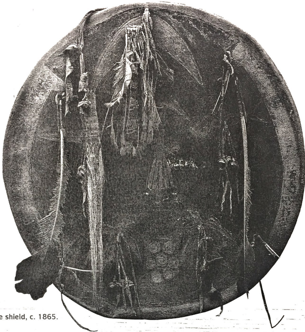
Cheyenne shield, c. 1865.

Anon. Cheyenne, Native American Shield, 1860/68 hide, rawhide, buckskin, poly-chromed, paint, feathers, cornhusks, 19 1/2 diam. (The Detroit Institute of Arts, Gift of Detroit Scientific Association.)